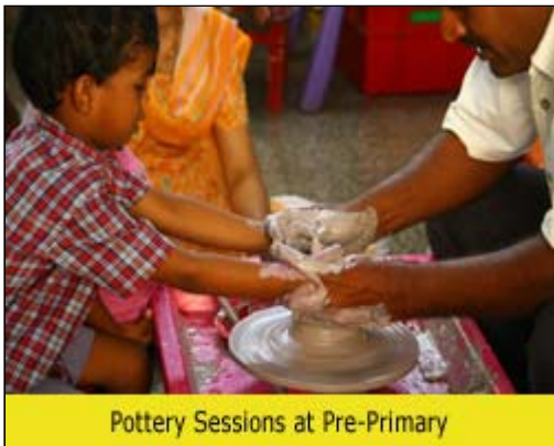
Pottery Sessions at Pre-Primary