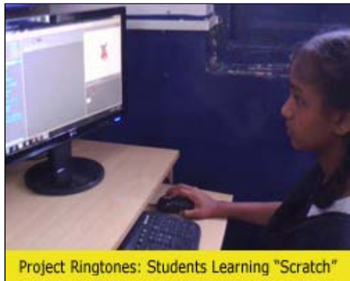
Project Ringtones: Students Learning "Scratch"

The first term has seen interesting developments across all our schools both in Mumbai and at Igatpuri. Introduction of pottery-making at the Pre-Primary level has brought a sense of calm and boosted self expression and self esteem among our students. In Project Ringtones, our Upper Primary students are learning "Scratch", a programming language that helps them build their own interactive games and animations. Our Secondary Section teachers were invited by the Municipal Corporation of Greater Mumbai (MCGM) to conduct virtual classes in Maths and Science for students from other MCGM Schools.