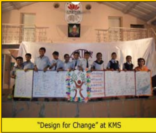
"Design for Change" at KMS

For the first time, our students participated in an Inter-school Football Tournament. It has been a rewarding experience and the students now look forward to the next tournament in December 2011. Our judo champions participated in the District Sports Officer's Championship, and have bagged medals at the Mayor's Cup Tournament