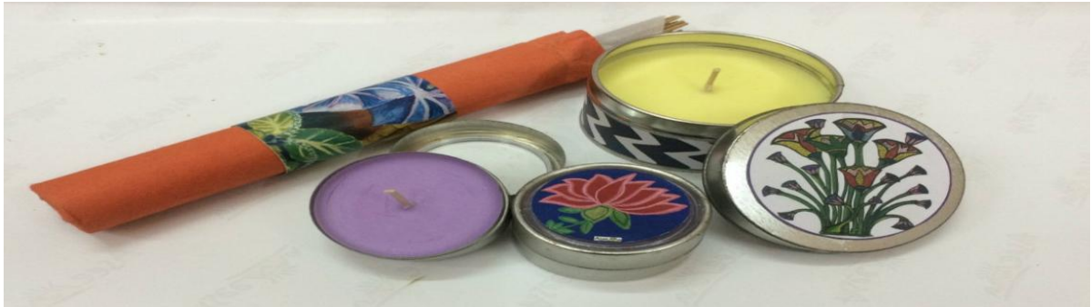
Festive Range of Aseema Products