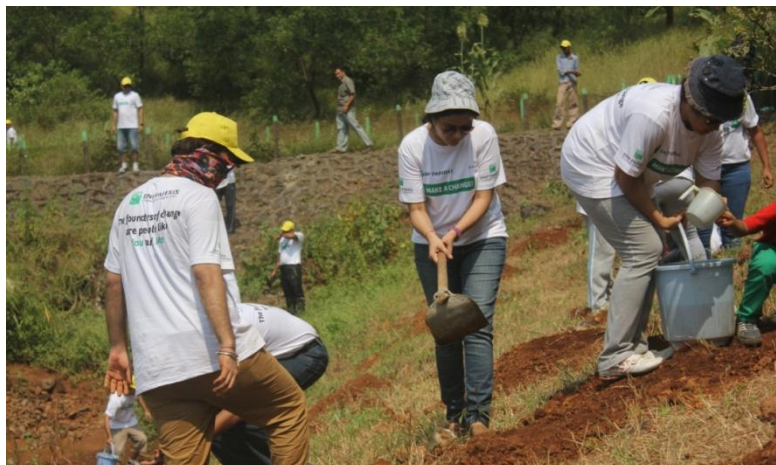
Tree Plantation at Igatpuri

While academic skills are essential to learn, social skills account for a vast amount of success in the workplace. School is the ultimate opportunity to gain experiences and