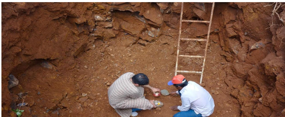
Foundation Work at Igatpuri