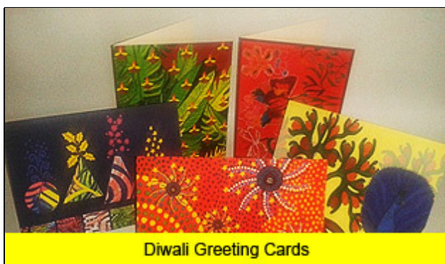
Diwali Greeting Cards