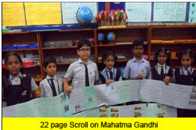
22 page Scroll on Mahatma Gandhi

It is fascinating to look at the world through the eyes of children. Their curiosity and zest for learning encouraged us to revisit the life of Mahatma Gandhi last month. On the eve of Gandhi Jayanti, some of our young children prepared a time line of his life and achievements. After weeks of research, they put together a 22 page scroll which they shared with their friends. While reading about this great leader, they often had