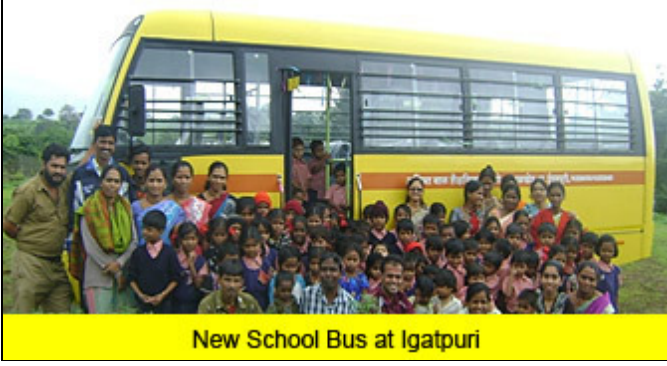
New School Bus at Igatpuri

The children of our Igatpuri project were helped further in accessing their right to education by Tata Motors Limited. Thanks to a new school bus donated by them, these young children who live in remote hamlets will no longer have to walk long distances to reach the Education Centre. They are very excited and eagerly look forward to their daily trips. For the first time, our community in Igatpuri celebrated World Indigenous People's Day in August 2012. About 500 people assembled at Aseema's Education Centre for Tribal Children in Awalkheda, where they were sensitized about their rights.