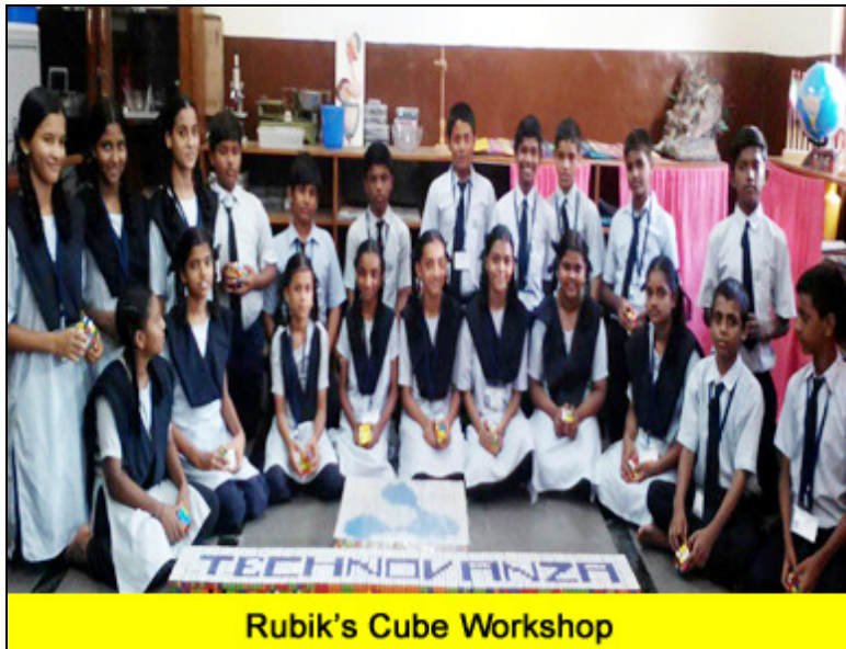
Rubik's Cube Workshop

In collaboration with Technovanza and Rubik's Cube Mumbai Open (RCMO), a workshop on solving Rubik's cube was conducted at the Pali Chimbai Municipal School. As the children worked on solving the cube, they learnt one can overcome challenges through a systemic and logical approach. They were also delighted to have a glimpse of Vedic Math.