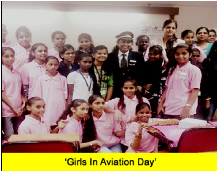
'Girls In Aviation Day'

– Students of the Pali Chimbai Municipal School