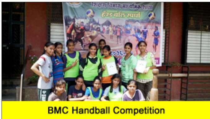
BMC Handball Competition

Apart from academic pursuits, our children made us proud in the Sports arena too. Students from our Mumbai Schools participated in Handball and Judo competitions, bagging accolades at the District and State Levels. They won 5 gold, 2 silver and 4 bronze medals.