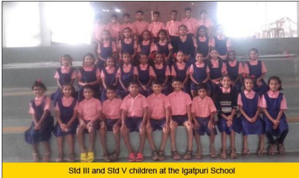
Std III and Std V children at the Igatpuri School

We look forward to continuing to see our children grow and flourish at Aseema and beyond.