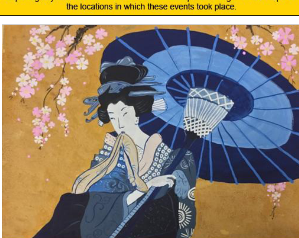
Students at the Pali Chimbai Municipal School (PCMS) studied different styles of Japanese paintings and created works based on these styles.

In April, following their SSC exams, students from Standard X visited a campsite in Vangani where they participated in a range of adventure sports including rappelling, fly foxing and archery. Through these activities, they worked on overcoming their fears, building their resilience and working effectively in teams.