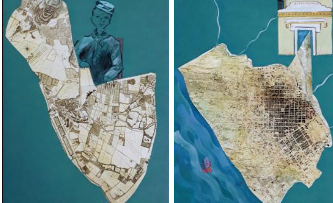
Students at KMS studied the life of Mahatma Gandhi and created works of art depicting key events in his life. These works incorporate images of the maps of the locations in which these events took place.

Aseema's students have continued to produce striking works of Art in our Room 13 Art studios. These studios reflect the philosophy of an art movement that began in Scotland, in which art is not "taught" but is the unique expression of each artist. In line with this, our children are exposed to different artistic styles ("see"), are encouraged to reflect on these styles ("think") and then given the space to create their own original works inspired by the relevant artistic style ("create"). We invite you to enjoy a few samples of the work created at Room 13 over the last few months.