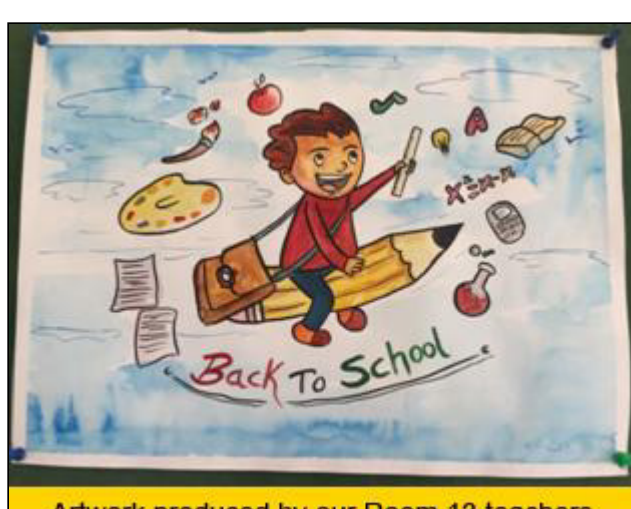
Artwork produced by our Room 13 teachers at PCMS to welcome children back to school

We are very happy to welcome our students back from their summer vacations, and look forward to another productive term at Aseema!