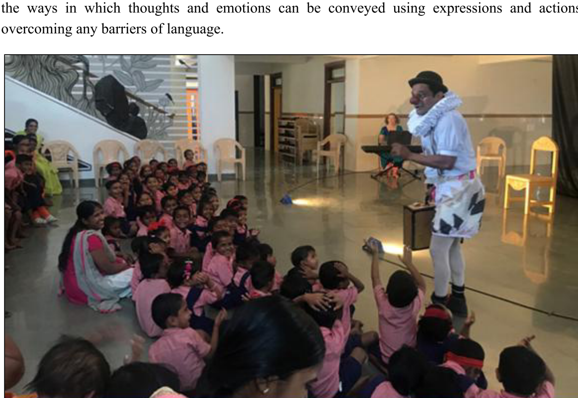
Children at Igatpuri enjoying a performance by Popo the Clown.

In April, the Akshara Foundation for Art & Learning organised a comedy show at the Igatpuri school. This was thoroughly enjoyed by all our students. The show also provided an insight into the ways in which thoughts and emotions can be conveyed using expressions and actions, overcoming any barriers of language.