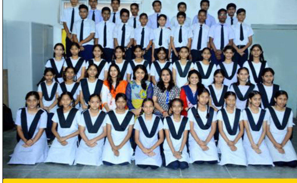
Std X students at Kherwadi Municipal School

We are confident that our students will continue to blossom as they embark on their journeys beyond Aseema. We thank you all for your generous support in enabling our children to follow their dreams.