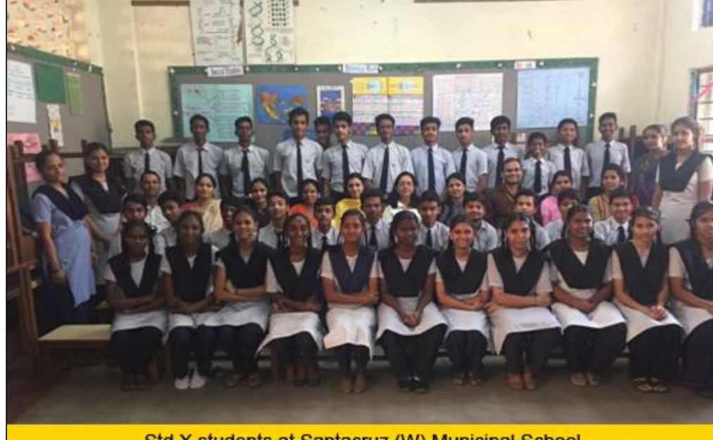
Std X students at Santaacruz (W) Municipal School

We are also very proud of the Standard III and Standard V children at our school in Igatpuri, who have all passed the National Institute of Open Schooling (NIOS) examinations. This year, we had 23 children appear for the Level A exam (equivalent to Standard III) and 17 children appear for the Level B exam (equivalent to Standard V). Our students' performance across all of the subjects tested is summarised below: