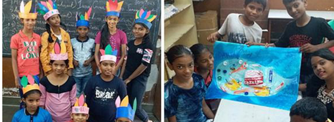
Summer Camp at Pali Chimbai Municipal School