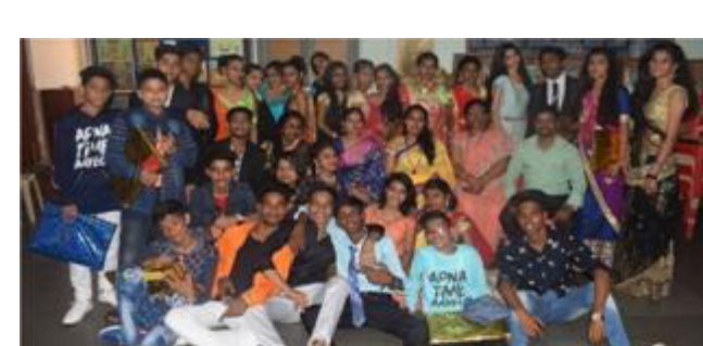
Farewell but not goodbye!

A Summer Camp! What a way to kick start the Summer vacations! The Summer Camp at Pali Chimbai Municipal School (PCMS) was a joyous, fun filled, learning event that lasted 7 whole days. Activities ranged from sports and games like wrestling, handball, basketball, khokho to sessions that widened their horizons. There were sessions on issues that affect the environment and global warming, Indian traditions, our world, nutrition and its importance, personality development and career options. Each session was conducted in a way that involved the children through activities ranging from dressing up, craft, public speaking, non-fire cooking and games. The highlight was a session on Haiku writing that was conducted by volunteers from the Batra Group. They were introduced to Japanese Haiku and wrote delightful Haiku poems on the person they loved. The camp ended with a party, with music, food and a talent show.